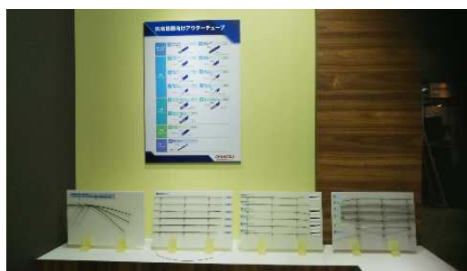
Photo:Cable parts for medical devices